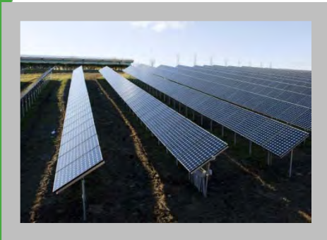
244 kW Timex, CT