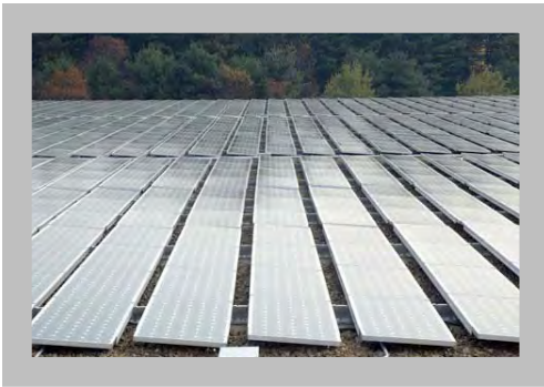
550 kW United Natural Foods, CT